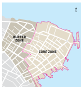
Map of George Town UNESCO World Heritage Site

For centuries, George Town has been the port of call for ships from all over the world. Today, the sense that overwhelms every traveller here is no different from when the founder Captain Francis Light and his first settlers made land here in 1786 - the desire to explore, discover and indulge.